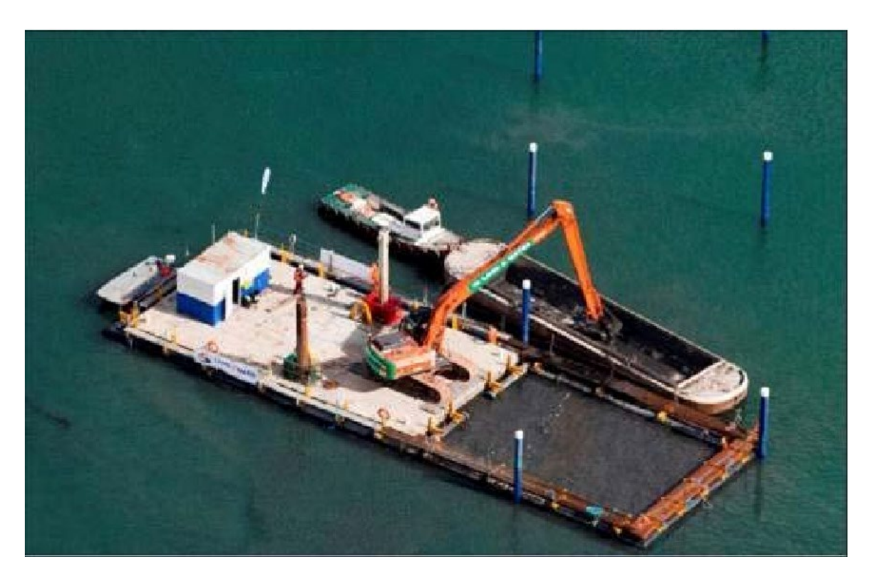
Typical dredging operation is comprised of an excavator mounted on a barge that removes dredged material within a turbidity curtain perimeter and transfers it to a nearby scow barge for transport. The scow barge is towed to a disposal site by a tug or support vessel.