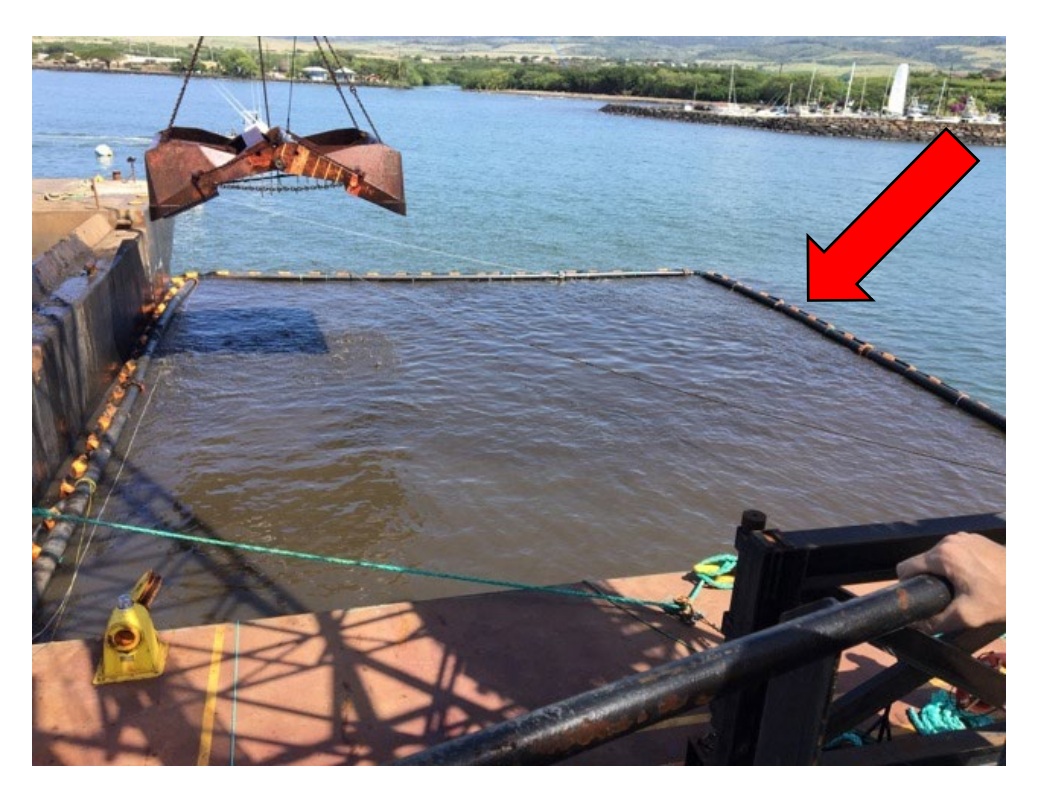
A dredge bucket is being lowered into work area that is surrounded by a turbidity curtain. A turbidity curtain contains any sediment (mud and sand) that may be suspended in the water, as shown by the darker shade of the water inside the curtain as compared to outside the curtain.