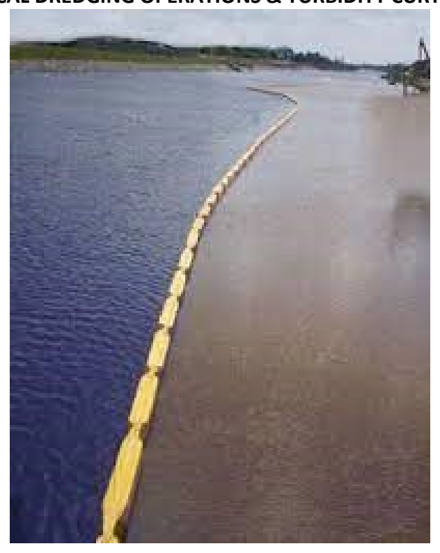
Example of a turbidity curtain containing suspended sediment, as shown by the darker shade of the water inside the curtain as compared to outside the curtain.