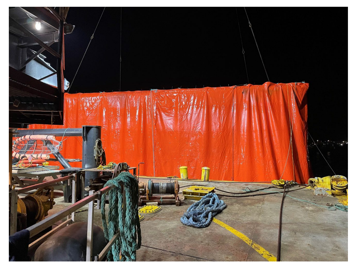
The orange turbidity curtain being lifted out of the water.

Example of a turbidity curtain containing suspended sediment, as shown by the darker shade of the water inside the curtain as compared to outside the curtain.